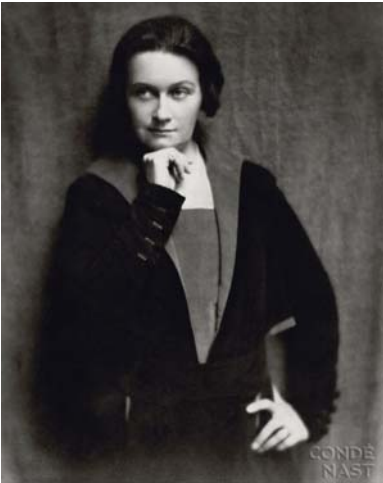
Lucile Watson in August 1921 Vanity Fair 1

This is another installment in the “Six Degrees of Sarah P. Duke Gardens,” my series about the connections of our Gardens to people and things that you might not expect.