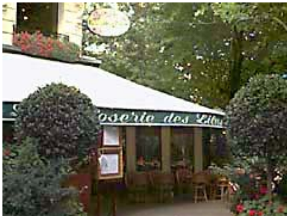
A photograph of La Closerie des Lilas ("Pleasure Garden of the Lilacs") today